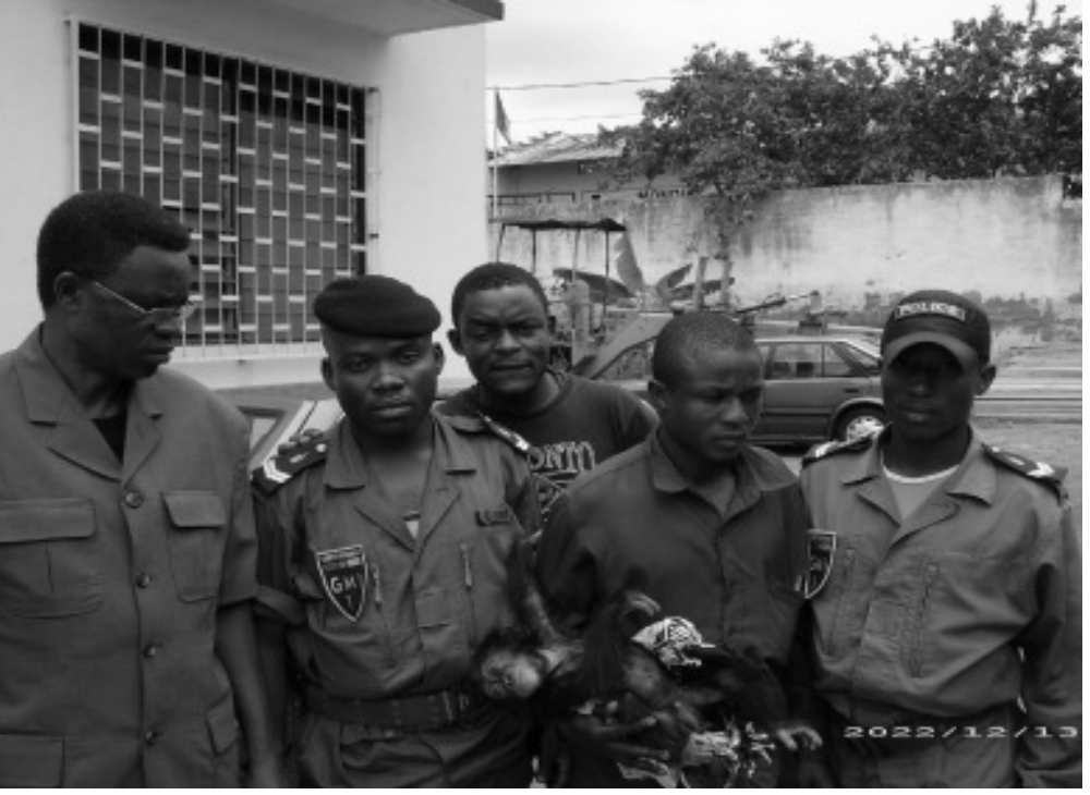
Ape delaer arrested, March 2006

-In the same month an operation took place against an Ape dealer in Kopongo Littoral Province. The operation was not fully successful, as while the chimp was rescued and the